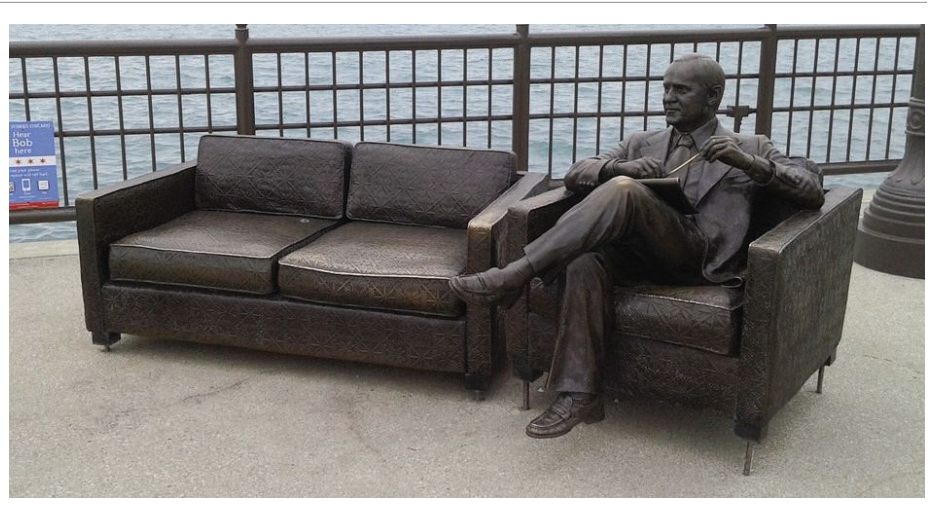
AT CHICAGO'S NAVY PIER, YOU CAN RECLINE ON A BRONZE REPLICA OF THE FAMOUS COUCH FROM "THE BOB NEWHART SHOW" AND TELL YOUR TROUBLES TO A SYMPATHETIC "BOB HARTLEY."

"Just like chess, academic life is very intellectual. But there are also important differences, such as more social interactions, more varied activities, and also a more secure life financially. Also, you have to accept a fair number of boring tasks, such as marking hundreds of students' exam essays. A big difference, which computer scientist and former chess correspondence